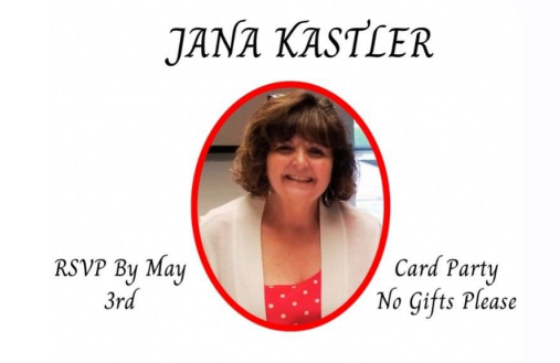
Retirement Party May 11th 2:00-5:00 PM 314 W 10th Coffeyville CCC Alumi Center TO RSVP: Text Clint Kastler